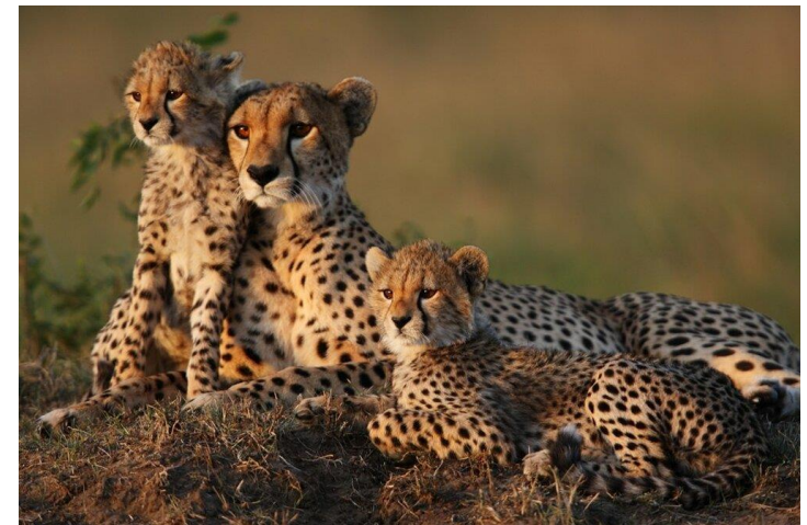
(4) Asiatic Cheetah