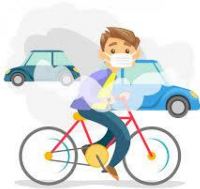
(1) Air Pollution

Q.5. Our last winter vacation was extended (in many North Indian cities) because of?