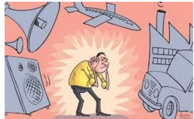
(4) Noise Pollution