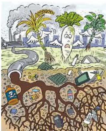
(3) Soil Pollution