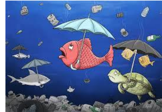
(2) Water Pollution