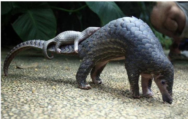
(3) Indian Pangolin