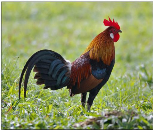
(3) Jungle fowl