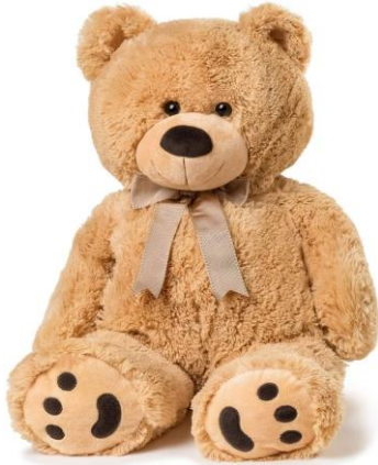
(1) Teddy Bear

Q.1. Which of the following animals from India is extinct?