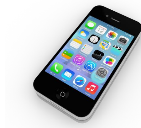
(2) Mobile Phone