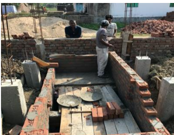
Figure 3: Septic tank with three chambers under construction

Out of this 95% population dependent on OSS, 44% have fully lined tanks (FLTOD) (T1A3C6). Mostly these tanks were either in square shape or rectangular shape in the middle and higher income groups but in lower income areas FLT's were made of 4-6 rings (3 ft diameter and 1.25 m depth) laid one over another and fixed with a layer of plaster. 29% of the population are dependent on septic tanks (STOD) with 2-3 chambers (T1A2C6). It could be observed from field survey and HH survey that the septic tank cannot be called as contained systems as they are connected to open drains. Since there is no monitoring or standardization followed in the construction of containment systems by