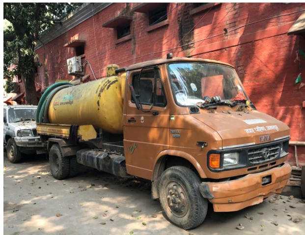
Figure 6: Desludging vehicle owned by ULB

As mentioned before, there is no functional sewer line in Jamalpur and all the black water and grey water generated from households is transported by open drains and discharged into agricultural fields (field observation). The septage emptied by manual emptiers is discretely dumped into any nearby open drain (figure-6).