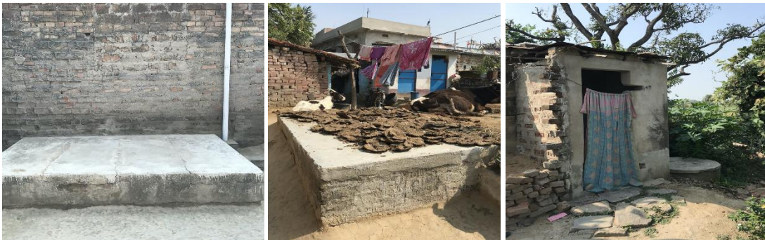
Figure 2: Septic Tank equipped with ventilation pipe, Fully Lined tank and Lined Pit semi-permeable wall and open bottom

Containment: In the absence of a sewer network the major population is dependent on Onsite Sanitation Systems (OSS). As per field observation, Key Informative Interviews and Focus group discussions with relevant stakeholders such as ULB officials, masons, desludging service providers and ward representatives, 95% of the population is dependent on OSS 6 . The most prevalent containment systems in Jamalpur are Fully lined tank (FLT) connected to open drain (FLTOD), Septic tanks connected to open drains (STOD) and Lined pits with semi-permeable walls and open bottom (LSO).