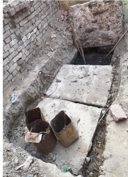
Figure 5: Tank emptied by manual emptiers from Dom community

Munger city which is 8km away from Jamalpur and they charge INR 5000-6000 (65-78 USD) per trip 14 . The emptying charge of the government operated truck mounted vacuum tanker is INR 1700 (22USD) per trip. During the survey it was found that in the economically weaker section of the society, non-mechanized means of desludging is preferred. Manual emptiers who are from a community locally called as “Doms” community work in groups of 3 to 5 people for emptying services. There are around 80 people in this community, who run this as a side business of manual emptying of contaminants in the city. They manually lift the sludge using a bucket and a shovel. The sludge removed is disposed in nearby open drains or surroundings 15 (figure-5). They charge INR 500 per ft depth of the containment system. They are almost involved in the business of selling pig meat and working in the ULB as safai karamcharis on contract basis 16 .