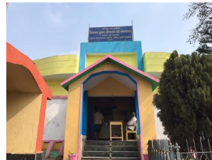
Figure 4: Community toilet maintained by Sulabh Shauchalay

Community Toilets/Public Toilets: In Jamalpur, there are 9 community toilets 11 . There are 7 CTs and 2 PTs inside Jamalpur municipal boundary. These toilets are connected to STOD. These septic tanks do not fulfil the requirement of the sewerage management system as stated in the CPHEEO (Central Public Health & Environmental Engineering Organization) manual on sewerage and sewage treatment (field observation). The average size of septic tanks in CT was found to be 25 cubic meters whereas in PT it was 30 cubic meters. The community toilets and public toilets were not very well serviced especially near commercial areas 12 . There are 7 CTs are under Jamalpur Nagar Parishad, whereas out of two PTs one is operated by Sulabh International and one is under petrol pump.