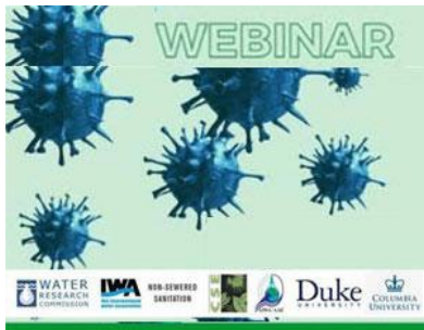
Dialogue on the need for mainstreaming non-sewered sanitation solutions – lessons from COVID-19 response