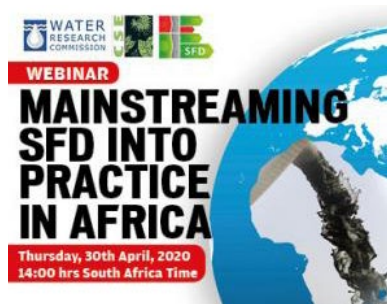
Mainstreaming SFD into practice in Africa