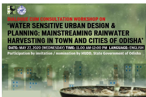
Dialogue cum Consultation Workshop on 'Water Sensitive Urban Design & Planning: Mainstreaming Rainwater Harvesting in town and cities of Odisha'