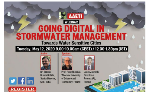
Going Digital in Stormwater Management: Towards Water Sensitive Cities