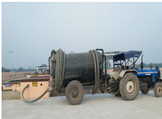
Desludger emptying septage at FSTP

FGD with the private operator revealed that, they transported the septage to the FSTP till incentives in form of cash were paid to them (31 January, 2020) by FSTP operator for decanting the faecal sludge to the FSTP, as FSTP site is quite far from the city. Some of the vacuum tankers from Gangagat, a neighboring ULB, also offer septic tank emptying services in Unnao city at low price and decant the septage illegally into the Nullahs or in agricultural fields nearby Lucknow-Kanpur highway.