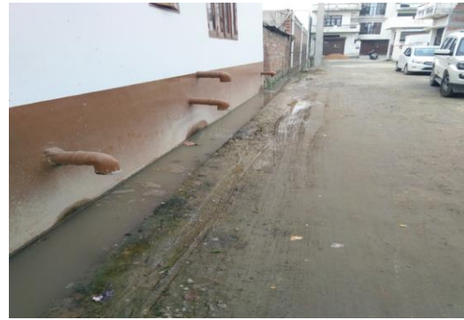
Outlet connected to open Drain