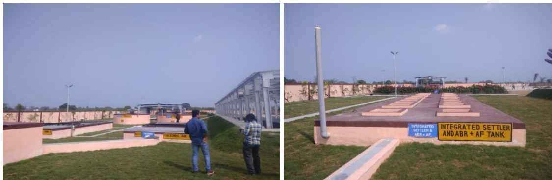
Figure 5: Faecal Sludge Treatment Plant of Unnao

Unnao generates an average of 25 MLD of wastewater. Presently, the wastewater/supernatant from Households is discharged into open ground or in the Nullahs. As per discussion with officials UPJN and NPP, Sewage Treatment Plant (STP) is proposed in Dakari, funded by AMRUT for treatment of sewage. The city generates 108 KLD of faecal sludge. For treatment of faecal sludge generated majorly from septic tanks or lined tanks of residential as well as commercial areas, 01 FSTP is operational in Unnao that is presently running. However, it treats only ~10 KLD of FS due to low number of tankers decanting at the FSTP premises.