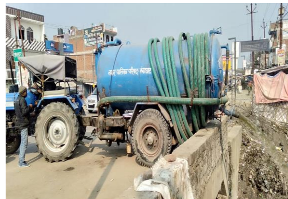
Desludger emptying septage into nullah