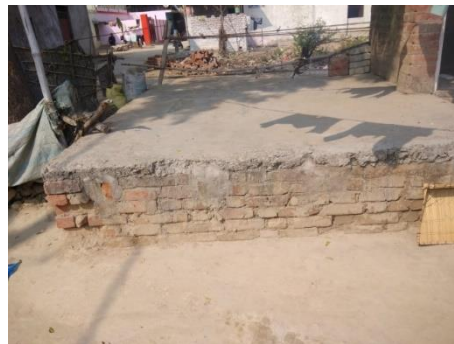
Fully lined tank