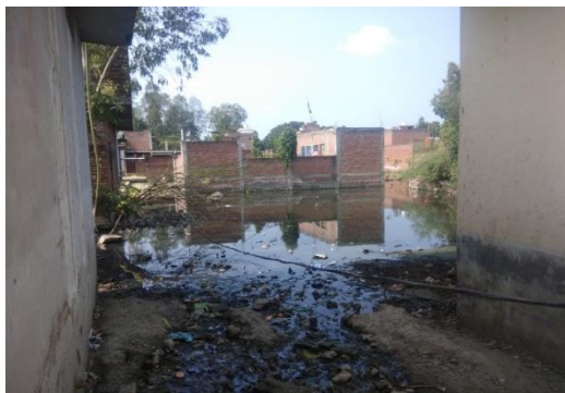
Open drain ending at open ground

As per discussion with NPP officials, there ~5 private vacuum tankers operating in the city. The faecal sludge carrying capacities of these trucks varies between 4000-5000 litres and the fee charged by them ranges from INR 800 to 1000 per trip. As per KII with private operator, the depth of septic tank differs with pertinence of location. These private desludgers advertise their contact number by distributing business cards or posters on wall. On an average, private vacuum tank, cumulatively complete 1-2 trips per day, monsoon being the peak season for emptying. On an average, it takes about 01 – 1.5 hours for completing one trip and 15 -20 km distance covered.