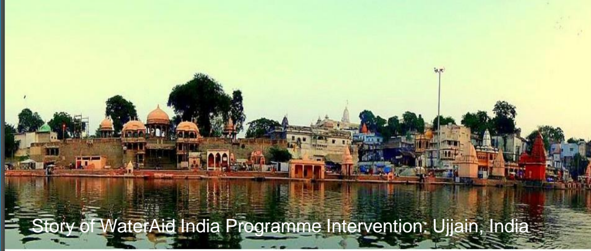
Story of WaterAid India Programme Intervention: Ujjain, India