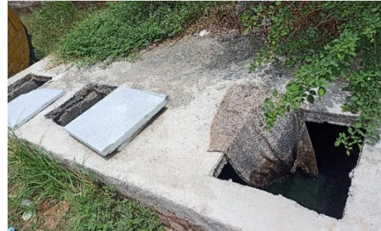
Figure 2: Septic Tank connected to Soak Pit at JE Colony

Containment: Based on sample household survey, KIIs and FGDs with relevant stakeholders, it was concluded that 2% population of the city is dependent on the On-site Sanitation Systems (OSS) (Field Observation; KII-6, 2020; KII-8, 2020). This small fraction of the population belongs to unauthorised residential colonies and institutes. The containment system prevalent in the city are septic tanks connected to soak pit (T1A2C5, 2%) (Field Observation; KII-6, 2020; KII- 8, 2020).