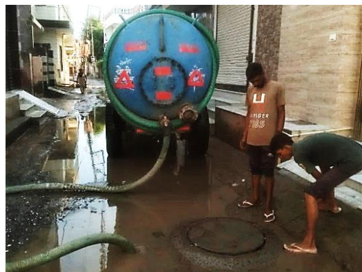
Figure 4: Emptying of sewer by vacuum tanker at Aggarsain Colony

Emptying: The city is dependent on privately operated mechanised desludging service for emptying of faecal sludge from Septic Tanks (Field Observation; FGD-1, 2020; KII-6, 2020). The emptying frequency varies from 2-3 year (demand based) depending upon the nature and the size of containment system (HH surveys; FGD-1, 2020). There are 12 registered private vacuum tankers plying in nearby villages. Each of these vacuum tractors are equipped with motorised pumps and have a storage capacity varying from 3500 to 6500 litres (KII-6, 2020; FGD-1, 2020). There are five sewer cleaning machines available with PHED (1 Super Sucker Machine, 1 Hydraulic and 3 Bucket type machines) (KII-4, 2020). However, vaccumm tankers are also involved in sewer cleaning (KII-6, 2020; FGD-1, 2020).