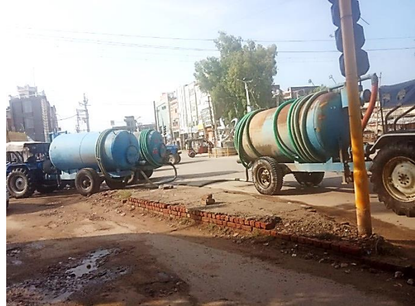
Figure 5: Truck mounted vacuum tankers near PHED

Transportation: The emptied faecal sludge is transported through tractor/ truck mounted vacuum tanker. Around 1-2 trips per month are made by each vehicle for the emptying of septic tanks (FGD-1, 2020). While, there are around 15 trips per month by each vehicle for sewer cleaning which is more prevalent in the monsoon due to overflowing sewers (KII-4, 2020; FGD-1, 2020). The emptied faecal sludge (FS) by vacuum tankers is discharged into open plots or fields in vicinity in order to reduce the no. of trips. The average distance covered by vehicles are 10-15 km from village to city but within the city the distance covered by vehicles varies from 5-6 km. About 95% of FS is getting emptied (F3) due to frequent emptying service which is illegally disposed off in nearby open areas. Therefore, variable F4 is considered 0% in SFD matrix