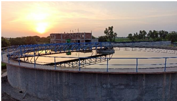
STP at Kelniyan

Presently, there is ~95% wastewater treatment through STPs as wastewater generation is 27.9 MLD of total water supply which complies with total treatment capacity of 45 MLD (KII-5, 2020; KII-8,2020). The lab report from the STP revealed that the discharge standards, prescribed by Central Pollution Control Board are met by the STPs, hence the wastewater and supernatant treated at the STP is considered 95% (w5a) which is safely used by the farmers for their agriculture purpose (KII-5,2020; CPCB, 2020). The treated wastewater and sludge generated at STP are used by the farmers through nullahs (Field observation; KII-5, 2020; KII-8, 2020). It has been observed that treated wastewater doesn’t reach the canal and is transported via nullahs for the use in farmlands (Field observation).