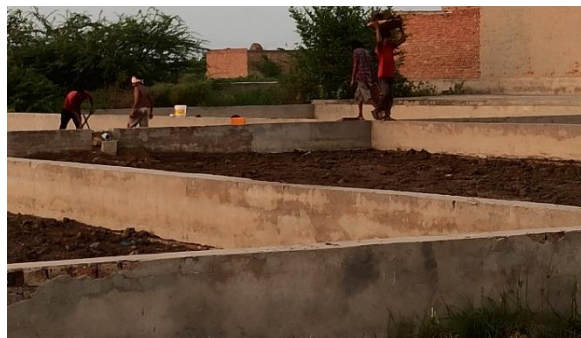
Sludge drying beds at Kelniyan STP