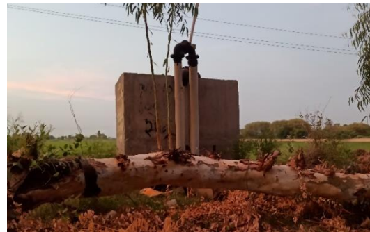
Treated wastewater used by farmers at Nattar STP