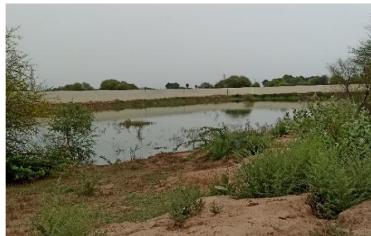
Untreated wastewater disposed off in open pond at Vaidwala Village