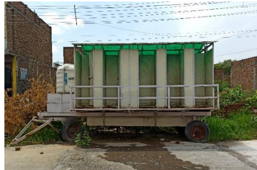
Figure 3: Mobile Toilet located at Fire Station

Community Toilets/Public Toilets: There are 12 Public Toilets, 5 Community Toilets and 5 Mobile toilets under the Swachh Bharat Mission which are directly connected to sewerage network (Field Observation, KII-1, 2020). Though the city has achieved Open Defecation Free (ODF) status in December 2016 and later in 2020 again, it is observed that Open Defecation (OD) is still practised by some 80 LIG households i.e. 0.2% of total population due to non-availability of community or public toilets in their close vicinity (HH Survey; FGD-3, 2020).