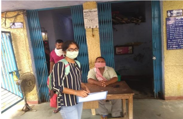
Figure 5. Swacch Public Toilet opposite MCF Office in Ward no. 15

2020). The average size of septic tanks in community toilet is 25 x 15 x 25 ft which is emptied once in a month or once in a year. The commercial buildings, Public Toilets (PTs)/ Community Toilets (CTs) and residential apartments have either direct sewer connections or ST/FLT connected to sewer lines (Field Observation; FGD-1, 2020; FGD-2, 2020).