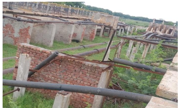
Figure 1: Pratappgarh STP

The sewerage network has been laid in the city within the administrative boundary of Faridabad with total 638 km of sewerage network which accounts for 30% city's population 6 (Field Observation; KII-2, 2020; KII-3, 2020) but wards pipelines are under repair. Rest 70% of city's population is dependent on hybrid system of on-site containment systems (OSS) a Septic tank and fully lined tank, whose outlet is connected to sewer lines & open drains respectively (Field Observation; FGD-1, 2020; FGD-2, 2020)