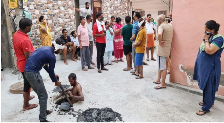
Figure 8: Manual scavenging in ward no. 17

There are no charges by Govt operated vacuum tractors whereas private operators charge the varying fees from INR 500-1000/ trip based on property type & containment size (FGD-2, 2020). The desludging services for the public and community toilets is carried out periodically by the service providers of Faridabad Municipal Corporation and hence are free of cost (FGD-3, 2020). All the emptying vehicles are maintained properly by Faridabad Municipal Corporation at the designated depot (Field Observation). The emptiers are not provided with Personal Protective Equipments (PPEs) for carrying out safe emptying services (FGD-3, 2020)