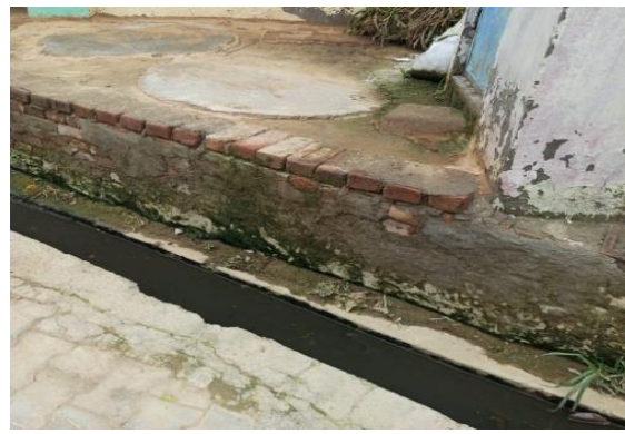
Figure 4: Lined Pits in a HH (Ward no. 6)

The general size of STs and FLTs varies from 5 – 12 ft * 4 – 8 ft * 6 – 15 ft, depending upon the household size, income level, community, etc (Field Observation; FGD-1, 2020; FGD-2, 2020). Based on the size, the construction cost varies from INR 10 K to INR 50 K (FGD-1, 2020). The septic tanks are two to three chambered with proper partition walls including plastered bottom whereas the FLTs are single chambered with impermeable walls & sealed vaults.