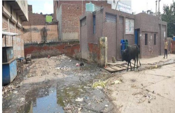
Figure 6: PT near Sabzi Mandi in Ballabgarh

As per 2011 census, 9% of the population was defecating in open but Municipal Corporation Faridabad has constructed PT/CTs & individual household laterines(IHHL) 15687 11 in numbers across the city especially for Below Poverty Line (BPL) near low income settlements and as a result, the city has achieved ODF status 12 on 02/08/2019 (KII-6, 2020; KII-7, 2020). Under SBM, there is a proposal for the new construction of 47 (CT) and (80) PT 13 in the city (KII-7, 2020). However, people living in slums and low income settlements are resorted to defecate in open due to poor accessibility & infrastructure or lack of maintainence in toilets (Field Observation; FGD-3, 2020)