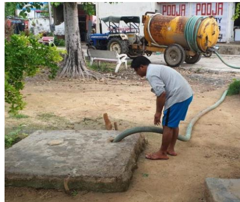
Figure 7: Emptying of ST by Private vacuum tractor

Emptying: The city is dependent on Govt./Private operated mechanised desludging services for emptying of faecal sludge from STs/FLTs/ Lined tanks/ Lined pits (Field Observation; FGD-2, 2020). The emptying frequency varies from 6 months to 2 years (demand based) across the city depending upon the nature and the size of containment system (FGD-2, 2020). During field visits, it has been observed that a significant proportion of population empties their STs /FLTs/Lined tanks/ Lined Pits within 6 months or even 4 times in a year. There are total 18 government operated vacuum tractors and 26 registered private operated vaccum tractors plying in the city. Each of these vacuum tractors are equipped with motorised pumps and have a storage capacity of 5000-6000 L. This even include non-registered private vaccum tankers plying in the city. In order to carry out the work in narrow and congested areas, these vehicles are equipped with ~120 ft long hose. Due to frequent emptying services, the variable F3 is considered 90% in SFD matrix