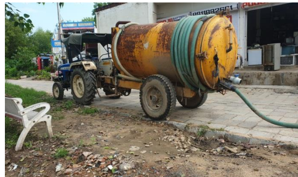
Figure 10: Private Vacuum Tankers

Transportation: The emptied septage is transported through the tractor mounted vacuum tankers. The average time taken to dispose emptied septage is around ~30 minutes (FGD-2, 2020). Around 5 to 6 trips per day are made by each vehicle (FGD-2, 2020). The faecal sludge (FS) emptied by Govt/ private operated vacuum tractors is discharged into designated disposal sites/nallahs instructed by Faridabad Municipal Corporation while private operators discharged Faecal sludge either in open fields or ground (FiledObservation; FGD-2, 2020). Therefore , the variable F4 is considered 54% in SFD matrix.