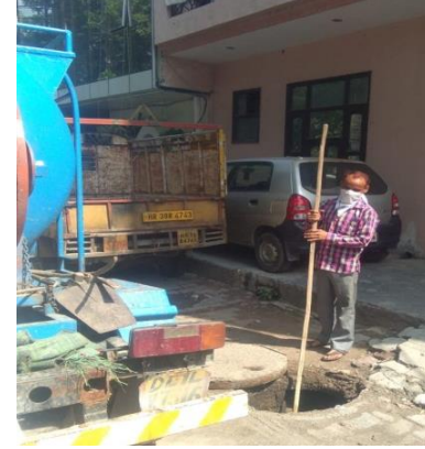
Figure 9: Sewer cleaning in ward no. 12

Manual scavenging is prevalent in the city in case of containment/sewer clogging (FGD-3, 2020). In general 2 to 3 labourers are required and charged around INR 500- INR 1000 and the cost increases based on size of containment and number of labourers required. Mainly a person without any safety gears goes in and removes the sludge & solid material using sapde/buckets which is loaded into a tractor (FGD-3,2020).