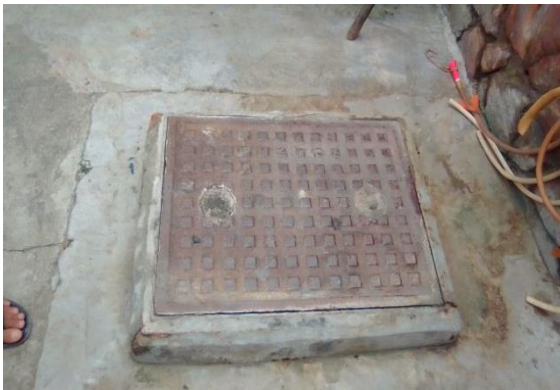
Figure 3: Septic Tank connected to sewer line in Ward no. 4 (Niharika/CSE, 2020)

Containment: Based on sample household survey, KIIs and FGDs with relevant stakeholders, it was concluded that 70% population is dependent on the On-site Sanitation Systems (OSS) (Field Observation; KII- 4, FGD-1, 2020; FGD-2, 2020). The containment systems prevalent in the city are septic tank (ST) connected to centralised foul/separate sewer (T1A2C2, 20%), fully lined tank (FLT) connected to centralised foul/separate sewer (T1A3C2, 20%), fully lined tank (FLT) connected to open drain or storm sewer (T1A3C6, 20%), Lined tank with impermeable walls and open bottom, no outlet or overflow (T1A4C10, 5%) and Lined pit with semi-permeable walls and open bottom, no outlet or overflow (T1A5C10, 5%) (Field Observation; FGD-1, 2020; FGD-2, 2020).