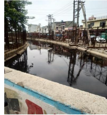
Figure 2: Untreated wastewater in Canal is flowing through the city

There are 11 intermediate sewage pumping stations and 3 main pumping stations 7 with 3 STPs in the city having an installed treatment capacity of 140 MLD (KII-8, 2020; KII-9,2020). The STPs are based on UASB and SBR technology. As per the current scenario, ~60% of the wastewater is reaching to the STPs 8 (W4a, S4d) considering the leakages from old defunct sewer lines which finds its way to either open drains, canal or River Yamuna (KII-5, 2020). There are 2 main nallahs in the city namely Budhiya nallah & Gaunchi nallah 9 that ends up directly flowing into river Yamuna. While, all open drains in the city are tapped and diverted into sewer line (KII-4,2020) but that also ends up in open canals to River Yamuna (Field observation; KII-5, 2020; FGD-2, 2020). Presently, around 117 MLD is reaching to the inlet of STP out of 197 MLD of total water supply (247 MLD) which is in compliance to total treatment capacity of 140 MLD. Therefore, varaibale W4a & S4d is considered 60% in SFD matrix.