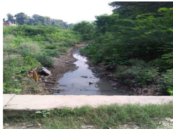
Figure 6: Bhunni drain

Transportation: The emptied faecal sludge is transported using a tractor mounted vacuum tanker. These vehicles cover a distance of 3-5 km per trip on an average 13 after desludging from the households and they decant the emptied FS in the nearby agricultural fields. In the KII with the private emptier it was revealed that time taken for emptying and discharge of FS is 1-2 hours on an average. None of the FS getting emptied is delivered to the treatment facility. However, the supernatant from the septic tanks and fully lined tanks flows in the open drains which gets treated at the Constructed Wetlands. As the length of drains is short but the open drains are not properly lined, it is assumed that 80% of the supernatant flowing in open drains reaches the treatment facility (S4e).