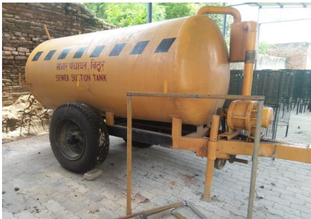
Figure 5: ULB owned vacuum tanker

The frequency of emptying varies from 15 to 20 years or more as the majority of the containment systems in the city is lined pits with semi permeable walls. Hence, it was observed that households that are taking too long to get their containments emptied are rather using their systems without emptying hence it was assumed that the population using their systems with emptying (F3) is taken as 50%.