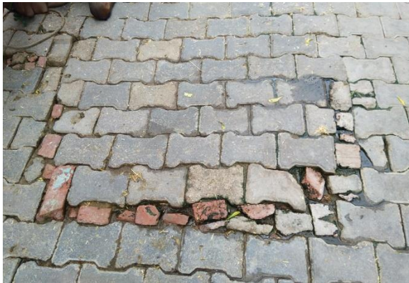
Figure 1: Overflowing lined pit

Containment: Based on sample household survey, KIIs and FGDs with relevant stakeholders it is estimated that 99% population is dependent on the On-site Sanitation Systems (OSS). 6,7,8 The most prevalent OSS in Bithoor is Lined pit with semi permeable walls and open bottom, no outlet and no overflow (T2A5C10), 87%). Fully lined tank (FLT) connected to open drains (T1A3C6, 6%) and Septic tanks connected to open drains (T1A2C6, 4%) are the other two prevalent systems after the aforementioned system and lastly Lined pit with impermeable walls and open bottom with no outlet and no overflow (T2A4C10, 2%).