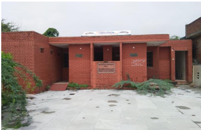
Figure 4: Occasionally used Public toilet constructed under Namami Gange

According to the Executive Officer and Computer Operator, 967 Individual Household Latrines (IHHL) have been provided to households having no toilets or access to community toilets in the vicinity or to households with insanitary toilets as of August 2020, under Swachh Bharat Mission (SBM). FLT in Bithoor are either square or rectangular in shape whereas septic tanks are mostly 2 chambered tanks. Most of the containment systems constructed even under SBM are Lined pits with semi permeable walls and open bottom, no outlet and no overflow. This is due to the local belief that lined pits with honeycomb structure is better than conventional septic tank as lined pits do not result in supernatant flowing out of system.