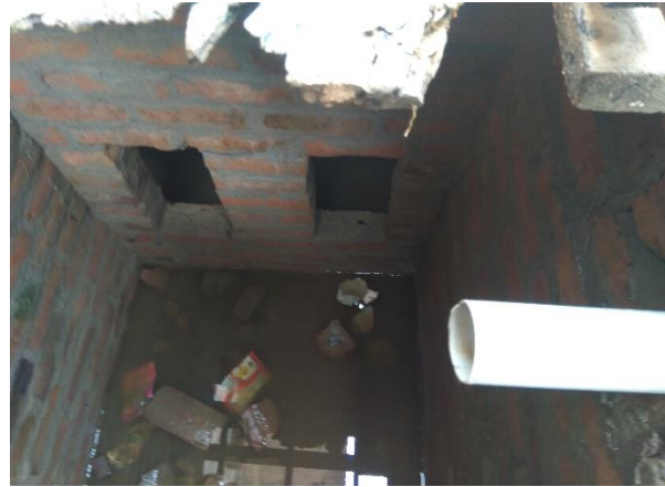
Figure 2: Under construction 2 chambered septic tank

According to the Executive Officer and Computer Operator, 967 Individual Household Latrines (IHHL) have been provided to households having no toilets or access to community toilets in the vicinity or to households with insanitary toilets as of August 2020, under Swachh Bharat Mission (SBM). FLT in Bithoor are either square or rectangular in shape whereas septic tanks are mostly 2 chambered tanks. Most of the containment systems constructed even under SBM are Lined pits with semi permeable walls and open bottom, no outlet and no overflow. This is due to the local belief that lined pits with honeycomb structure is better than conventional septic tank as lined pits do not result in supernatant flowing out of system.