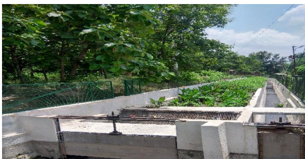
Figure 7: Constructed wetlands at Bhunni Drain

Transportation: The emptied faecal sludge is transported using a tractor mounted vacuum tanker. These vehicles cover a distance of 3-5 km per trip on an average 13 after desludging from the households and they decant the emptied FS in the nearby agricultural fields. In the KII with the private emptier it was revealed that time taken for emptying and discharge of FS is 1-2 hours on an average. None of the FS getting emptied is delivered to the treatment facility. However, the supernatant from the septic tanks and fully lined tanks flows in the open drains which gets treated at the Constructed Wetlands. As the length of drains is short but the open drains are not properly lined, it is assumed that 80% of the supernatant flowing in open drains reaches the treatment facility (S4e).