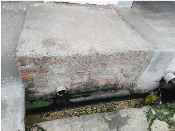
Figure 3: Fully lined tank connected to open drain