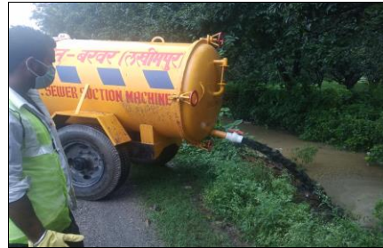
Figure 8: Faecal Sludge disposed at agriculture field /Drain

Treatment/Disposal: BNPP has no designated site for the disposal of FS. Therefore in the absence of such provision the government emptiers discharge the faecal sludge in nearby agricultural fields. Usually local farmers allow them to discharge the FS on their farm lands, which is later used by farmers as a soil fertiliser.