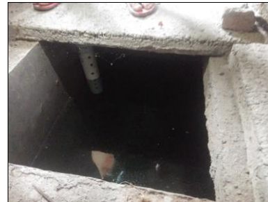
Figure 2 : Septic tank connected to open drain