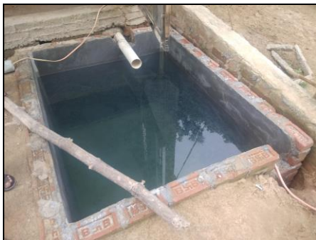
Figure 3 : under construction single chamber fully lined tank