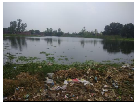
Figure 7 : Water Bodies in city contaminated by domestic wastewater

Transportation: The emptied faecal sludge is transported using a tractor mounted vacuum tanker. These vehicles cover a distance of 5 to 8 km per trip on an average after desludging from the households and they decant the emptied FS in the nearby agricultural fields. In the KII with the government emptier (KII-4) it was revealed that time taken for emptying and discharge of FS is 1-2 hours on an average. Barwar NP does not have any FS treatment facility. However they have allotted the land under SBM( U) for constructing a Faecal Sludge Treatment Plant (FSTP).