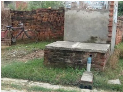
Figure 1 : Fully lined tank connected to open drain

Containment: Based on sample household survey, KIIs and FGDs with relevant stakeholders it is estimated that 100% population is dependent on the On-site Sanitation Systems (OSS). The most prevalent OSS in Barwar is fully lined tank connected to open drain outlet (T1A3C6, 90%). Other two prevalent systems in the city include septic tank connected to open drain (T1A2C6, 5%) and lined tank with semi-permeable walls and open bottom with no outlet and no overflow (T2A5C10, 5%).