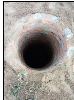
Figure 4 : under construction tank with semi permeable wall and open bottom

According to the Barwar BNP, Executive Officer and Senior Clerk-cum- Sanitation Incharge (KII-1,2), 1256 Individual Household Latrines (IHHL) have been provided to households having no toilets or access to community toilets in the vicinity or to households with insanitary toilets as of August 2020, under Swachh Bharat Mission (SBM). Fully Lined Tanks in Barwar are either square or rectangular in shape whereas septic tanks are mostly 2 chambered tanks. The size of these Fully Lined Tanks are much larger than conventional Septic Tanks. Most of the containment systems constructed under SBM are fully lined tanks connected to open drain. This is due to lack of technical know-how of local masons on designing a proper septic tank. Households only empty their containment systems when either they start overflowing or toilets get choked. Average emptying frequency is 10 years.