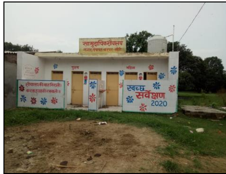
Figure 5: Community toilet constructed under SBM(U)

Emptying: The city is dependent on Barwar Nagar Panchayat (BNP) owned vacuum tanker for services for emptying of faecal sludge (FS). BNP has one vacuum tanker which is operational. City has narrow and congested roads. The vacuum tanker are equipped with a motorised pump, storage tank of 5000 litres capacity and a 250 ft long hose pipe to access containment systems in narrow roads and congested areas (KII-4). During FGD with households and sanitation worker it was found that some cases of manual scavenging are still prevalent.