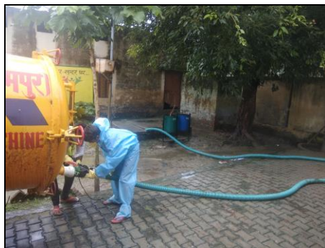
Figure 6 : ULB owned vacuum tanker operators

The frequency of emptying varies from 10 to 15 years or more as the majority of the containment systems in the city is fully lined tank lined connected to open drain. Hence, it was observed that households that are taking too long to get their containments emptied are rather using their systems without emptying. Hence, the percentage of containment emptied for fully lines tanks is assumed to be 50%. Properly designed septic tanks are emptied more frequently. Tanks with semi-permeable walls and open bottom are hardly ever emptied. (FGD-2)