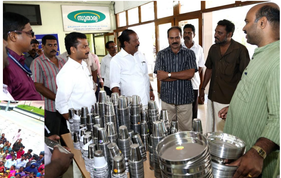
Distribution of Steel plates & glasses for Green Protocol