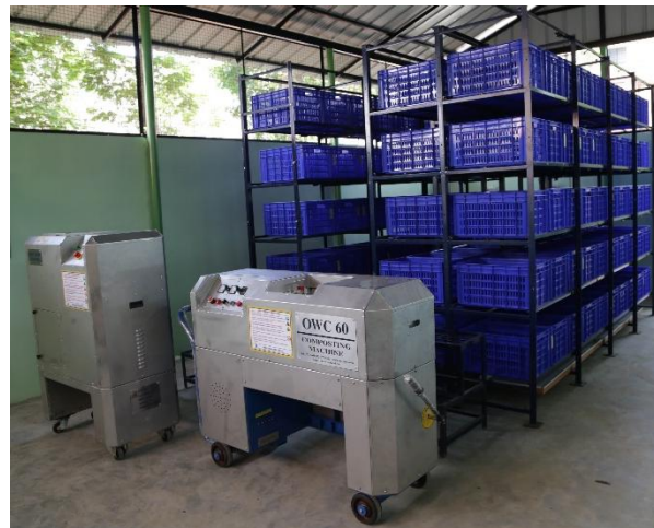
Organic Waste Converter