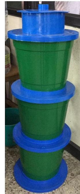
Kitchen Bin composter