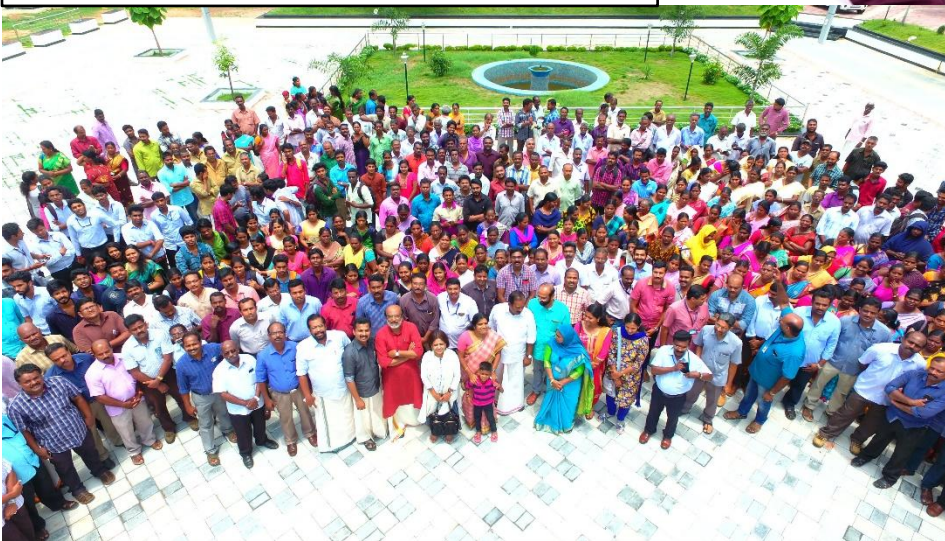
Green Protocol Campaign team