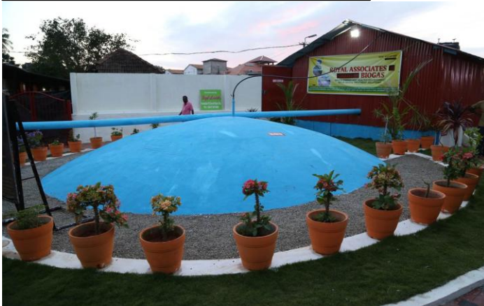
Community Bio gas units