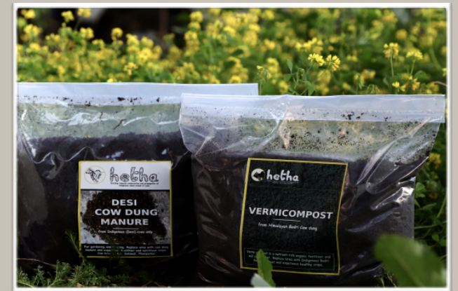
Cow dung is used to make manure/logs.