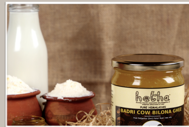
Value Added Products