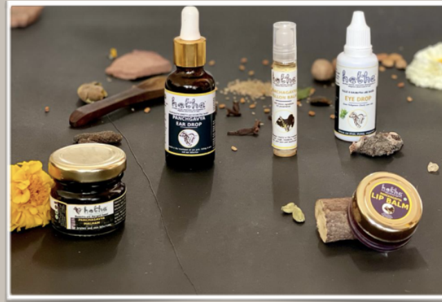
Gaumutra is used to make Panchagavya medicines