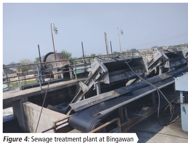
Figure 4: Sewage treatment plant at Bingawan