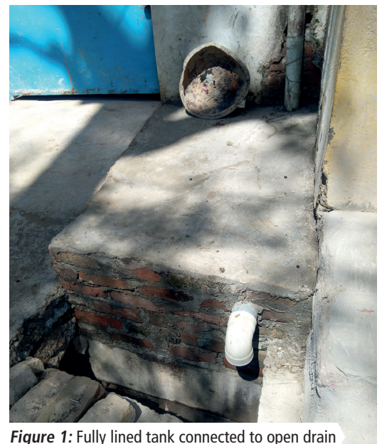
Figure 1: Fully lined tank connected to open drain