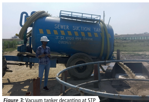
Figure 3: Vacuum tanker decanting at STP