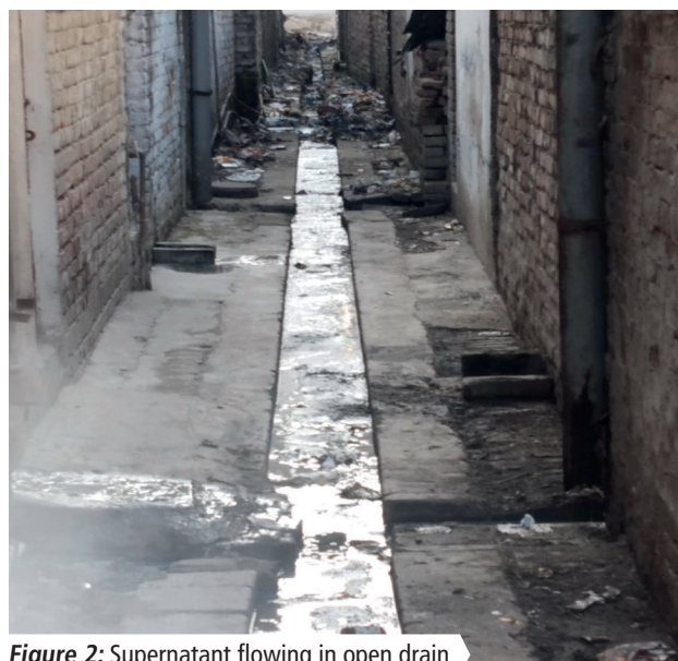
Figure 2: Supernatant flowing in open drain