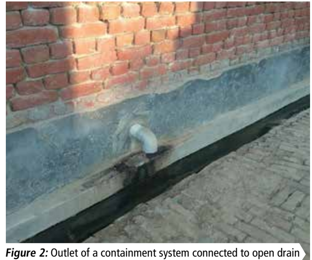
Figure 2: Outlet of a containment system connected to open drain