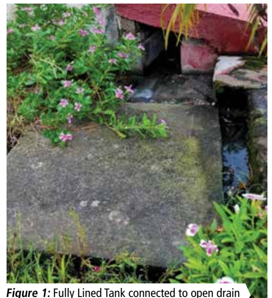
Figure 1: Fully Lined Tank connected to open drain