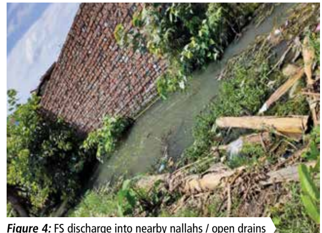
Figure 4: FS discharge into nearby nallahs / open drains