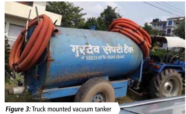
Figure 3: Truck mounted vacuum tanker