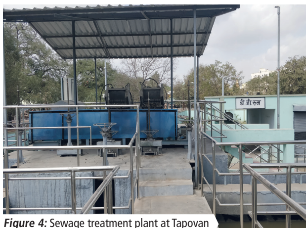
Figure 4: Sewage treatment plant at Tapovan