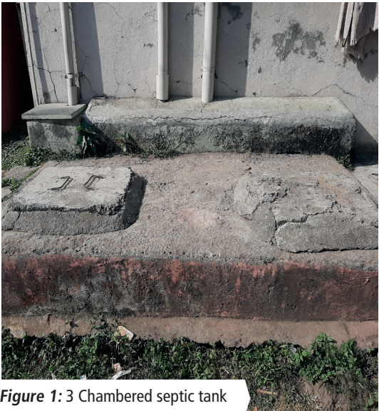
Figure 1: 3 Chambered septic tank