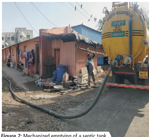
Figure 2: Mechanized emptying of a septic tank