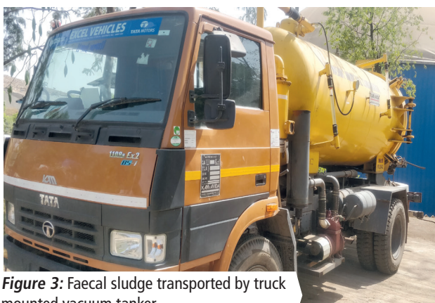
Figure 3: Faecal sludge transported by truck mounted vacuum tanker