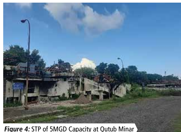
Figure 4: STP of 5MGD Capacity at Qutub Minar