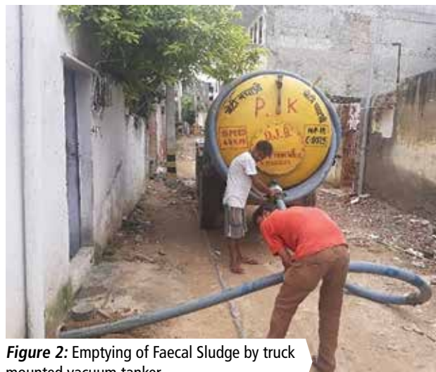
Figure 2: Emptying of Faecal Sludge by truck mounted vacuum tanker