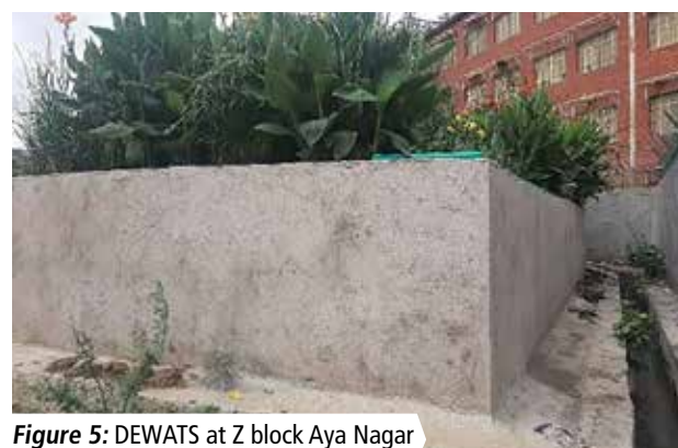
Figure 5: DEWATS at Z block Aya Nagar