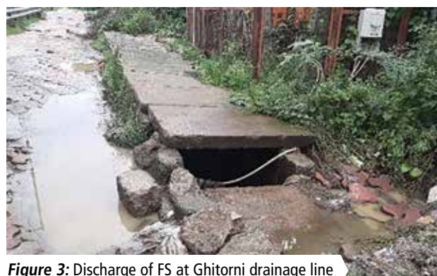
Figure 3: Discharge of FS at Ghitorni drainage line