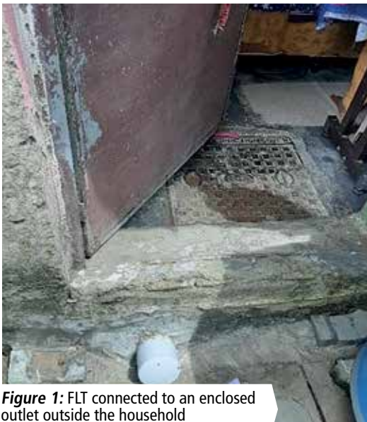
Figure 1: FLT connected to an enclosed outlet outside the household