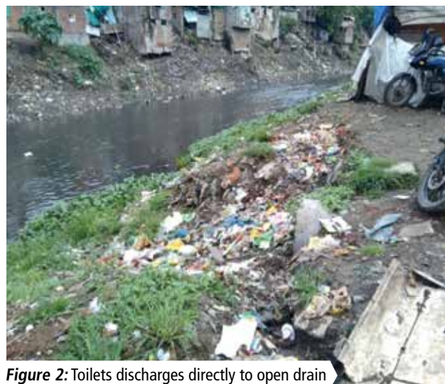
Figure 2: Toilets discharges directly to open drain