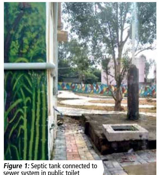
Figure 1: Septic tank connected to sewer system in public toilet