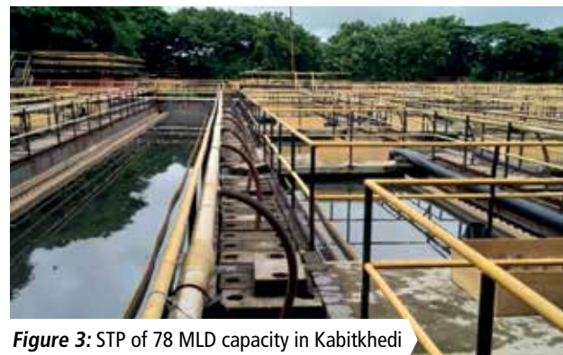
Figure 3: STP of 78 MLD capacity in Kabitkhedi