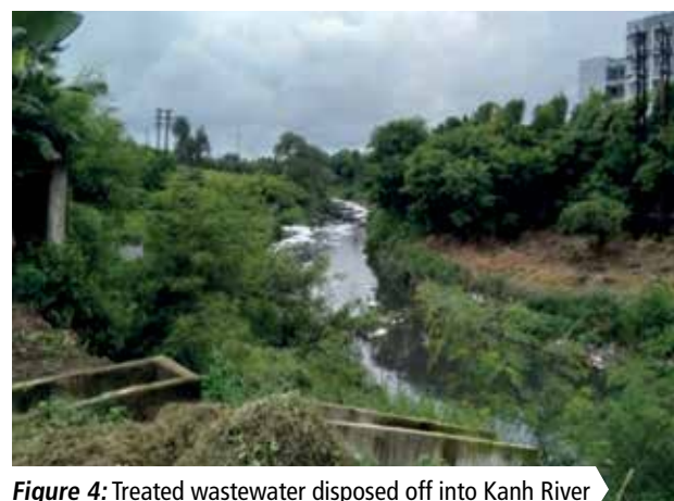
Figure 4: Treated wastewater disposed off into Kanh River