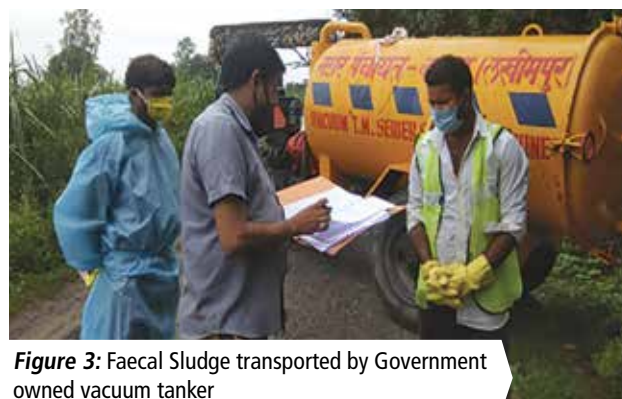
Figure 3: Faecal Sludge transported by Government owned vacuum tanker