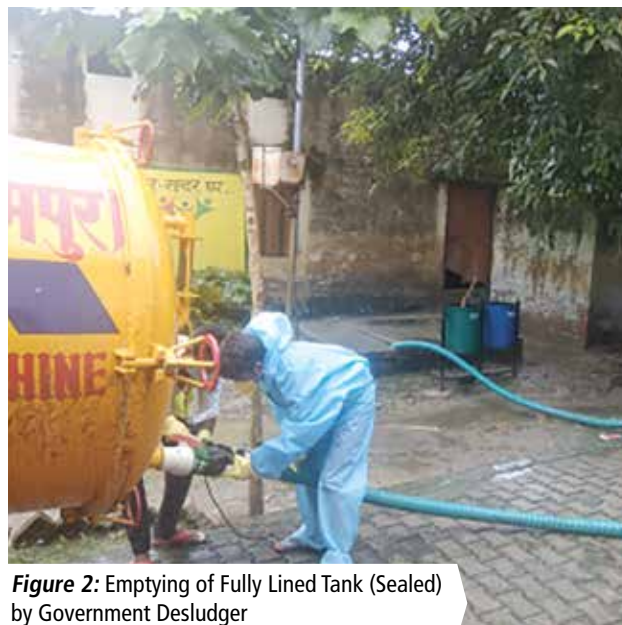
Figure 2: Emptying of Fully Lined Tank (Sealed) by Government Desludger