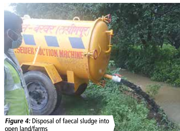
Figure 4: Disposal of faecal sludge into open land/farms