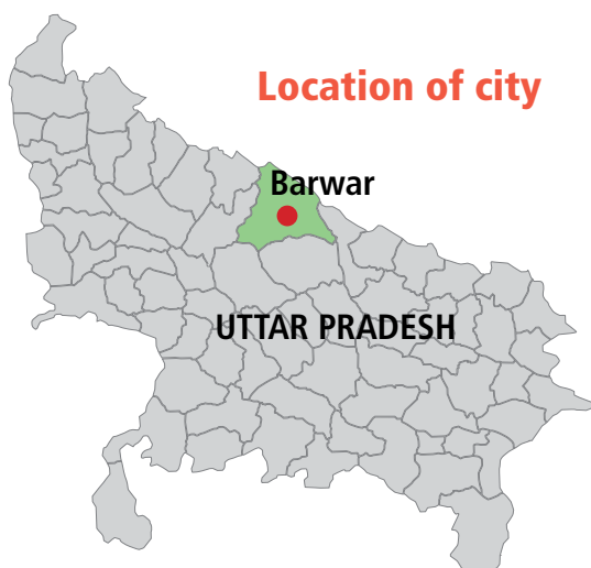
Location of city