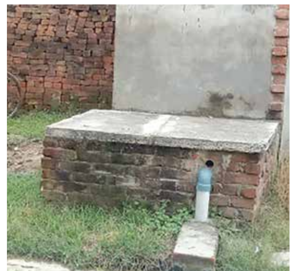
Figure 1: Fully Lined Tank (Sealed) connected to open drain