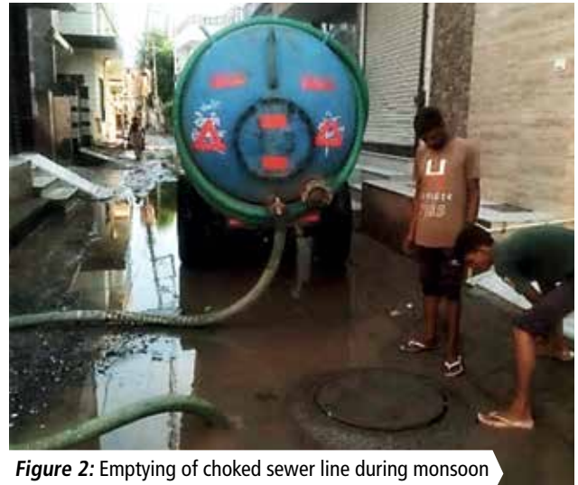
Figure 2: Emptying of choked sewer line during monsoon