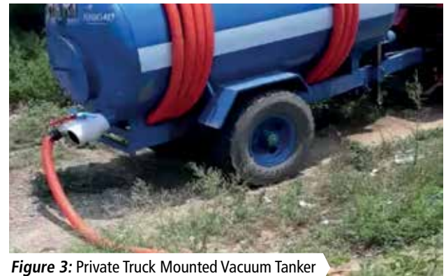
Figure 3: Private Truck Mounted Vacuum Tanker