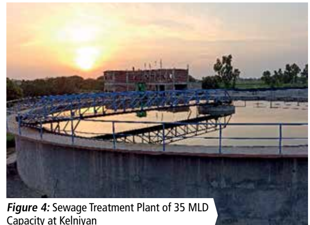
Figure 4: Sewage Treatment Plant of 35 MLD Capacity at Kelniyan