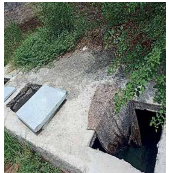
Figure 1: Three Chambered Septic Tank of a Household