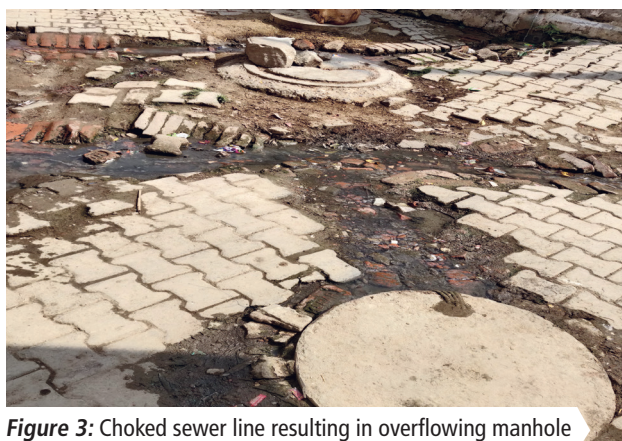
Figure 3: Choked sewer line resulting in overflowing manhole