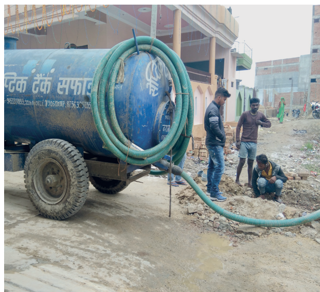
Figure 2: Private desludger providing emptying service