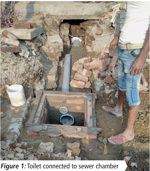
Figure 1: Toilet connected to sewer chamber