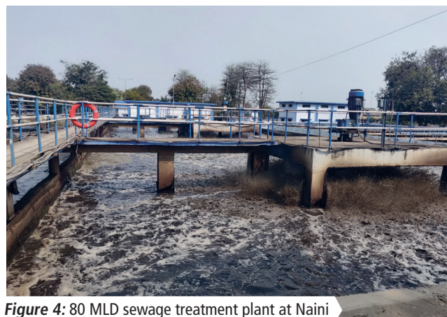
Figure 4: 80 MLD sewage treatment plant at Naini