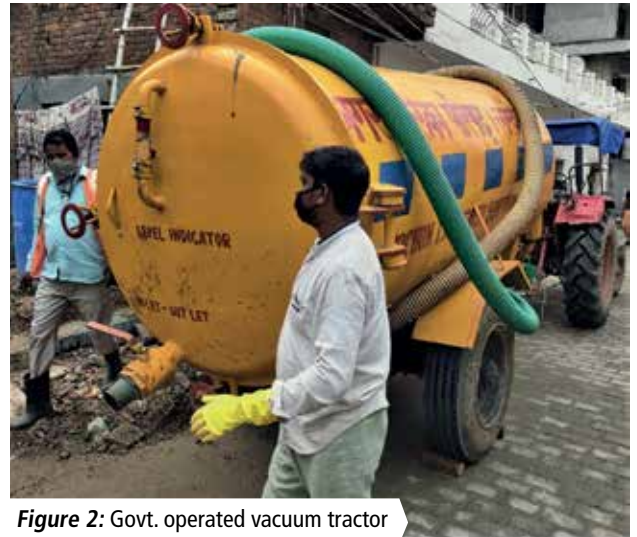
Figure 2: Govt. operated vacuum tractor