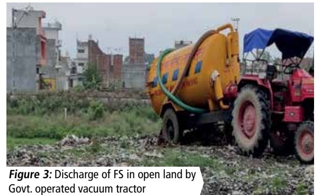
Figure 3: Discharge of FS in open land by Govt. operated vacuum tractor