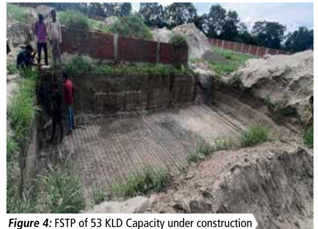
Figure 4: FSTP of 53 KLD Capacity under construction