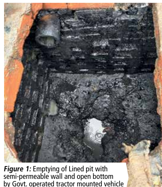
Figure 1: Emptying of Lined pit with semi-permeable wall and open bottom by Govt. operated tractor mounted vehicle