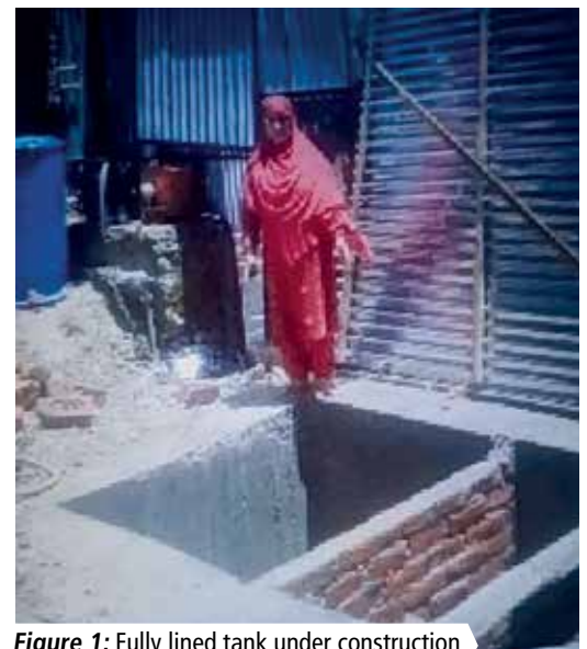
Figure 1: Fully lined tank under construction