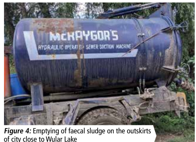
Figure 4: Emptying of faecal sludge on the outskirts of city close to Wular Lake