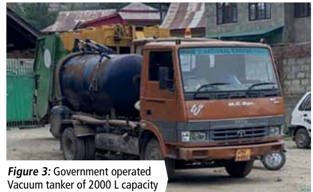
Figure 3: Government operated Vacuum tanker of 2000 L capacity