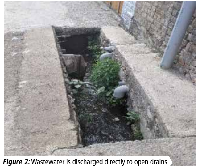
Figure 2: Wastewater is discharged directly to open drains