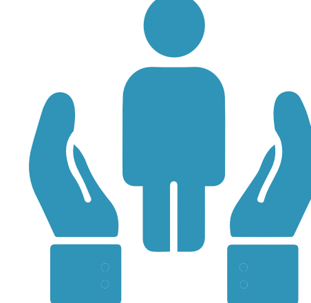
Social Worker or NGO