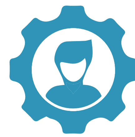
CSE Technical Support Unit