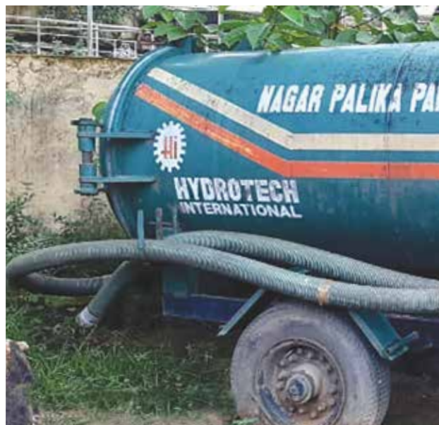
Figure 2: Government operated tractor mounted vacuum tanker