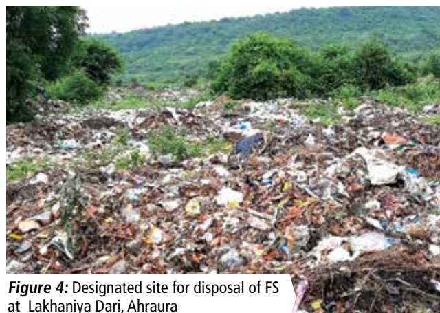
Figure 4: Designated site for disposal of FS at Lakhaniya Dari, Ahraura