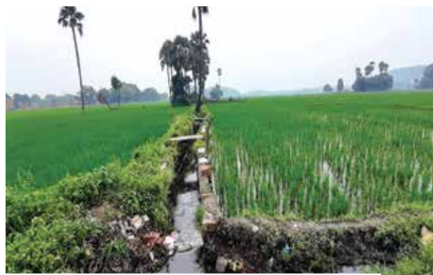
Figure 3: Big drains carrying supernatant and wastewater