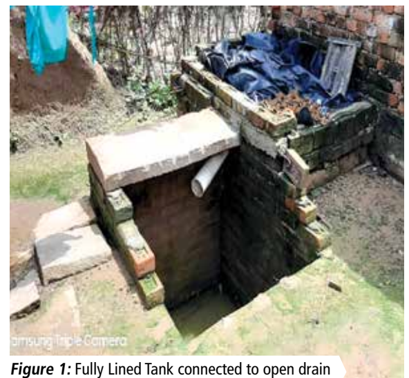
Figure 1: Fully Lined Tank connected to open drain