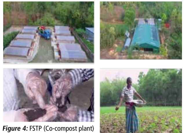
Figure 4: FSTP (Co-compost plant)