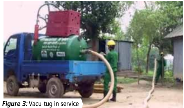
Figure 3: Vacu-tug in service