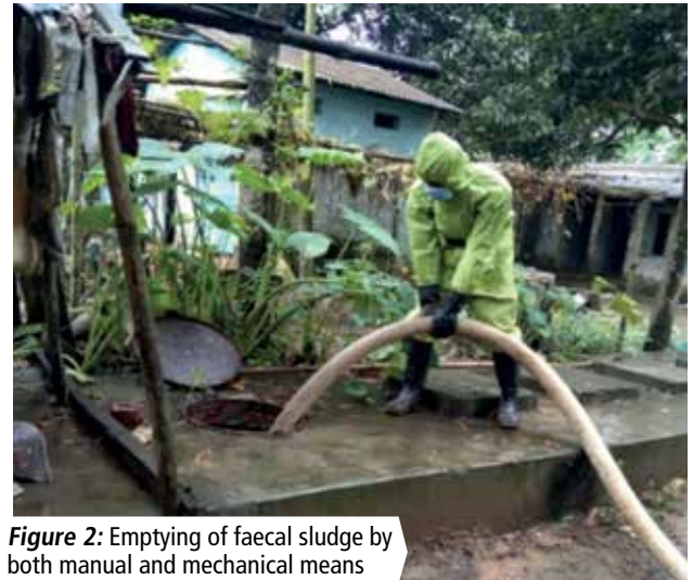
Figure 2: Emptying of faecal sludge by both manual and mechanical means