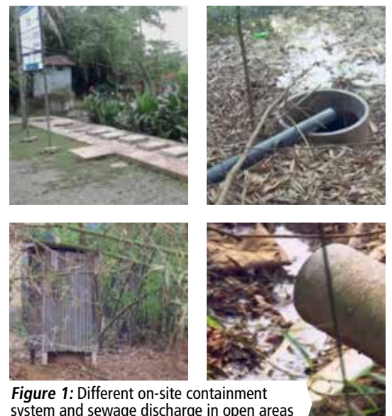
Figure 1: Different on-site containment system and sewage discharge in open areas