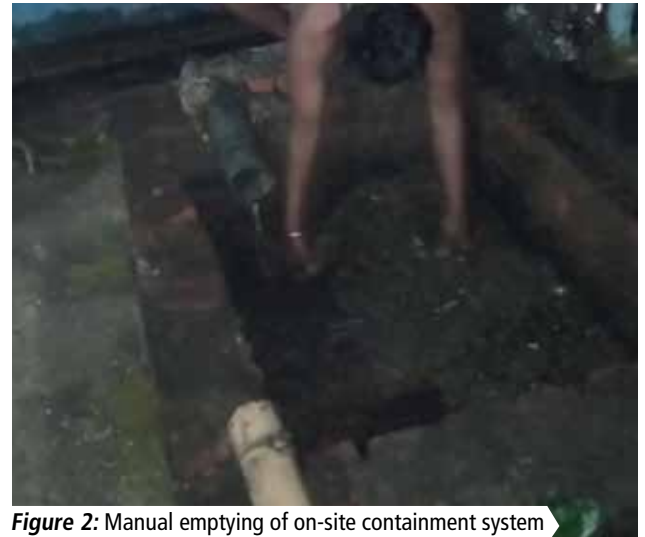
Figure 2: Manual emptying of on-site containment system