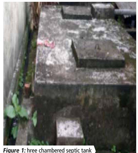
Figure 1: three chambered septic tank