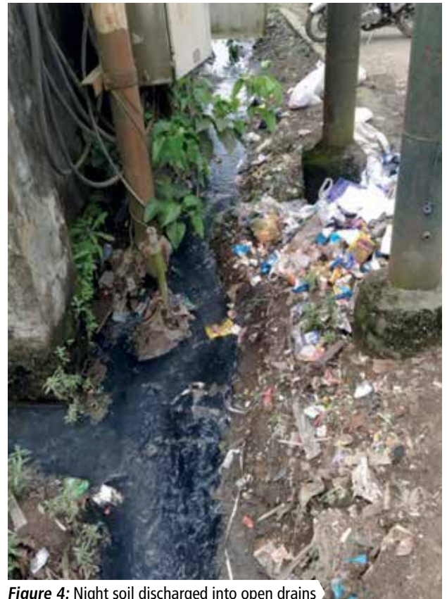
Figure 4: Night soil discharged into open drains