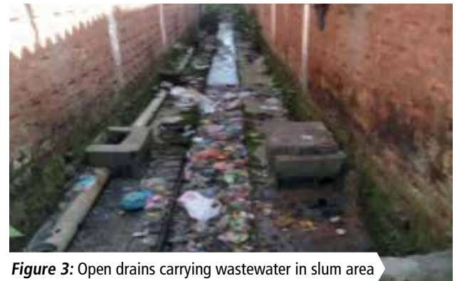
Figure 3: Open drains carrying wastewater in slum area