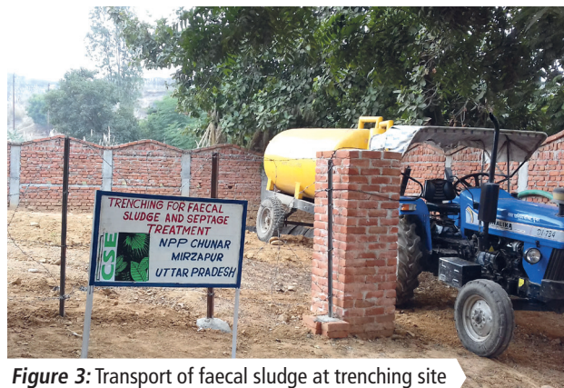
Figure 3: Transport of faecal sludge at trenching site