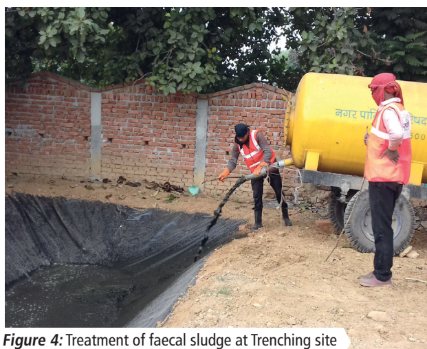
Figure 4: Treatment of faecal sludge at Trenching site