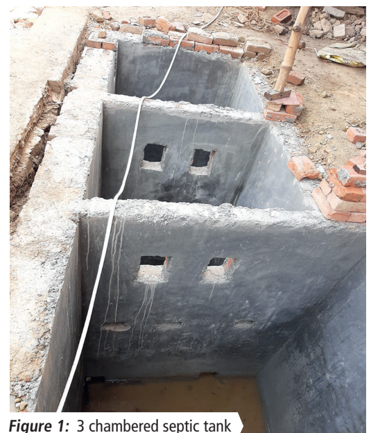
Figure 1: 3 chambered septic tank