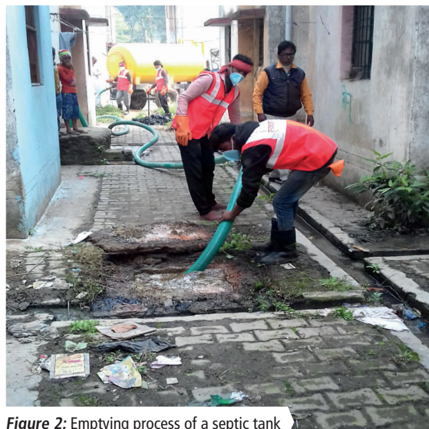
Figure 2: Emptying process of a septic tank