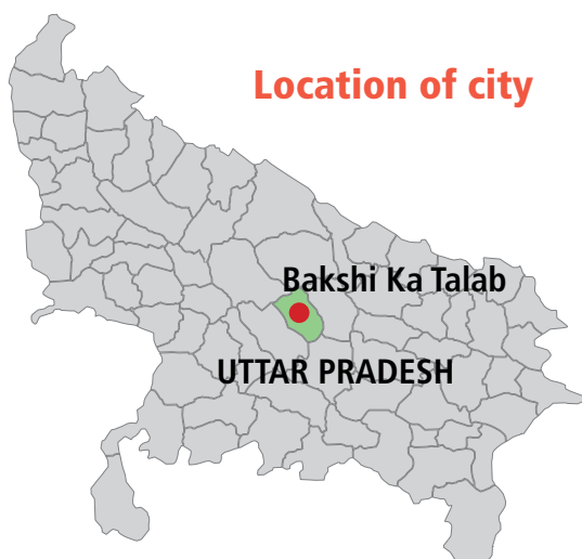
Location of city