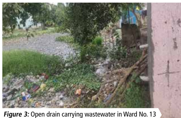
Figure 3: Open drain carrying wastewater in Ward No. 13