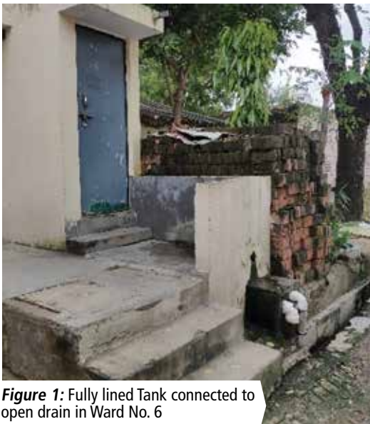
Figure 1: Fully lined Tank connected to open drain in Ward No. 6