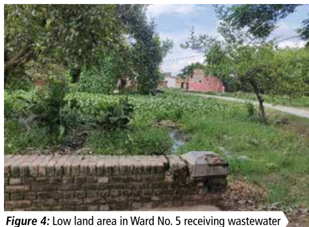
Figure 4: Low land area in Ward No. 5 receiving wastewater