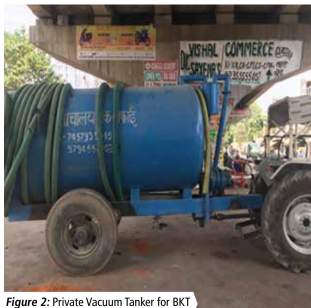
Figure 2: Private Vacuum Tanker for BKT