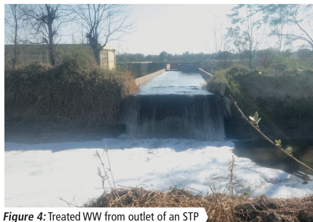
Figure 4: Treated WW from outlet of an STP