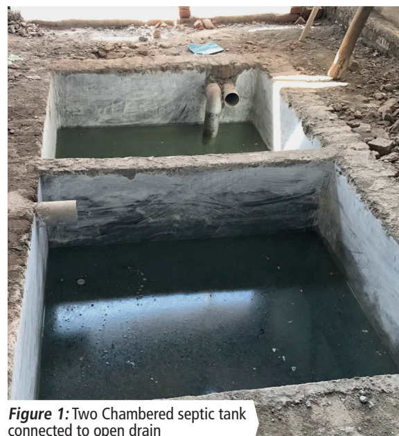
Figure 1: Two Chambered septic tank connected to open drain