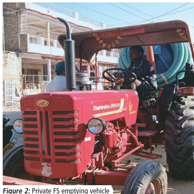
Figure 2: Private FS emptying vehicle