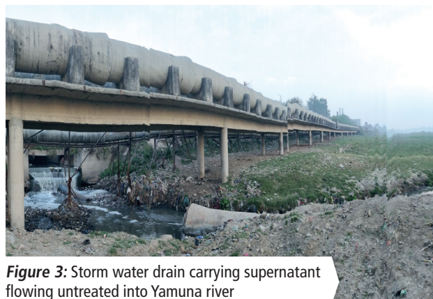
Figure 3: Storm water drain carrying supernatant flowing untreated into Yamuna river