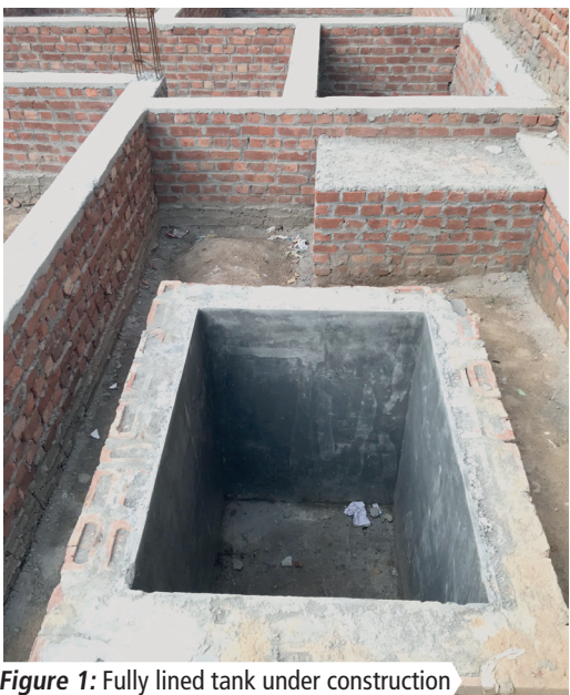
Figure 1: Fully lined tank under construction