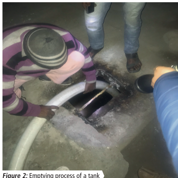
Figure 2: Emptying process of a tank