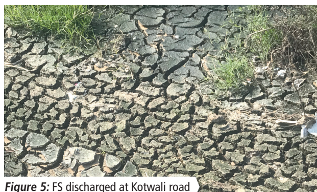
Figure 5: FS discharged at Kotwali road