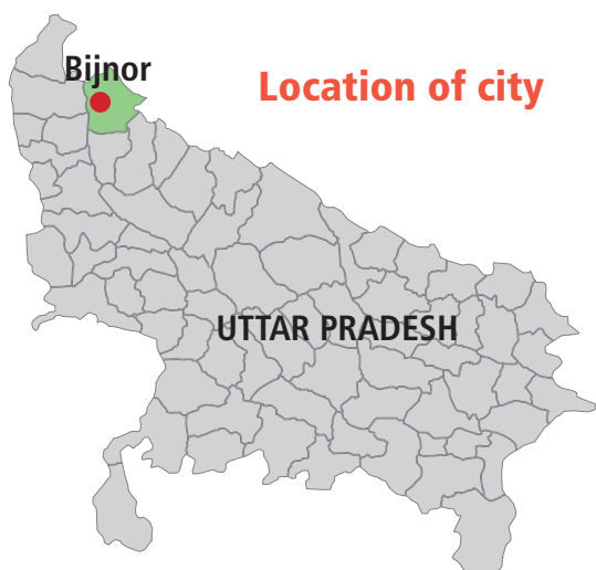
Location of city