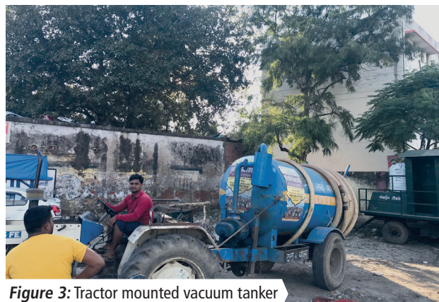
Figure 3: Tractor mounted vacuum tanker