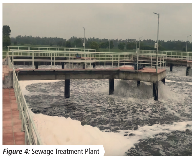
Figure 4: Sewage Treatment Plant