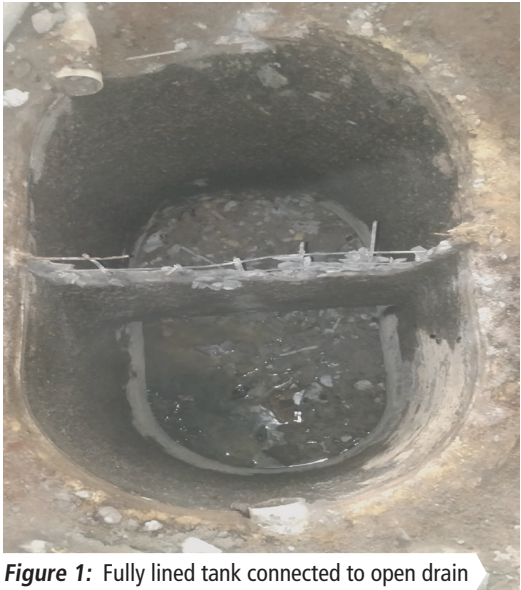
Figure 1: Fully lined tank connected to open drain