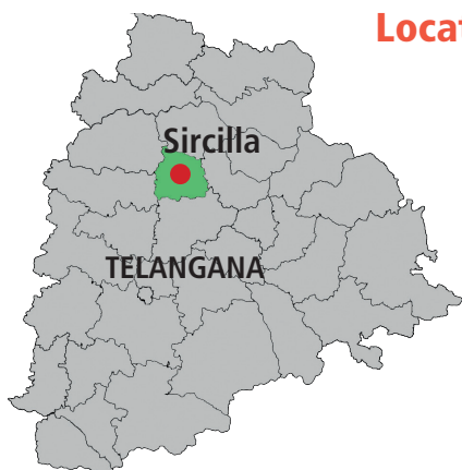
Location of city