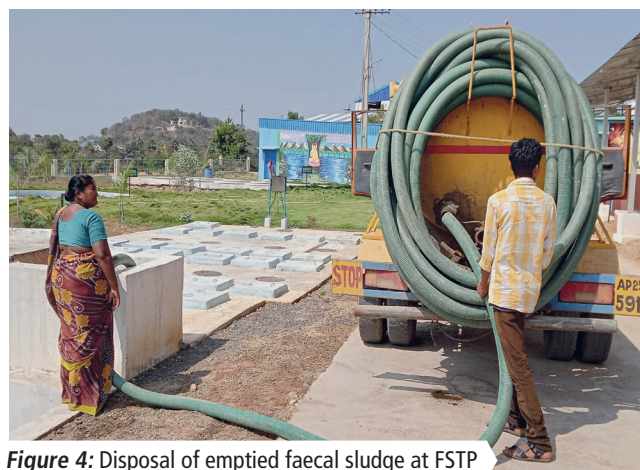
Figure 4: Disposal of emptied faecal sludge at FSTP