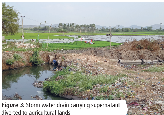
Figure 3: Storm water drain carrying supernatant diverted to agricultural lands