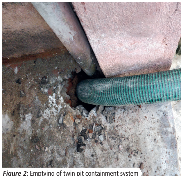
Figure 2: Emptying of twin pit containment system