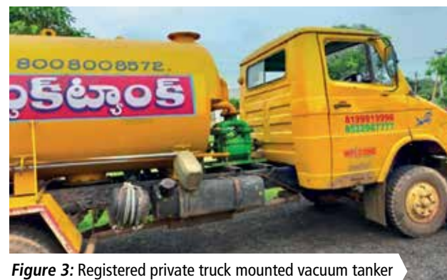
Figure 3: Registered private truck mounted vacuum tanker