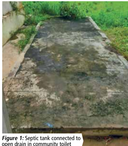
Figure 1: Septic tank connected to open drain in community toilet