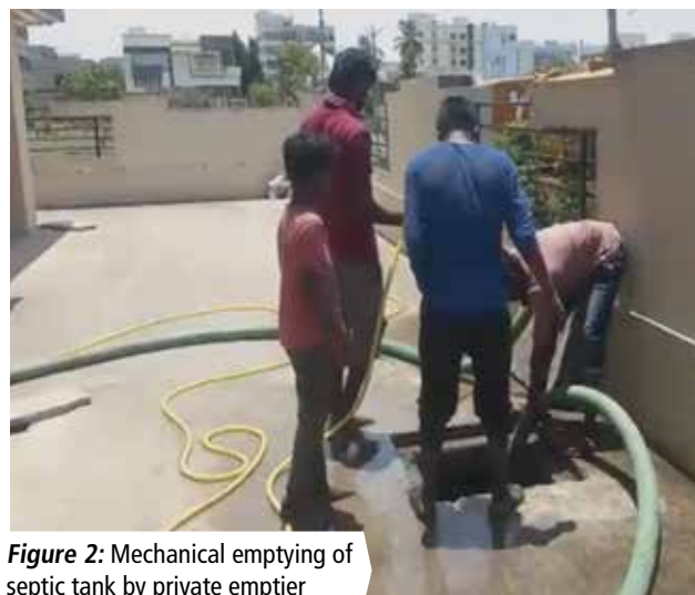
Figure 2: Mechanical emptying of septic tank by private emptier