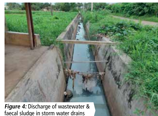
Figure 4: Discharge of wastewater & faecal sludge in storm water drains