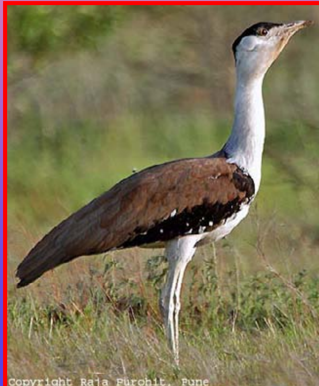
Great Indian Bustard